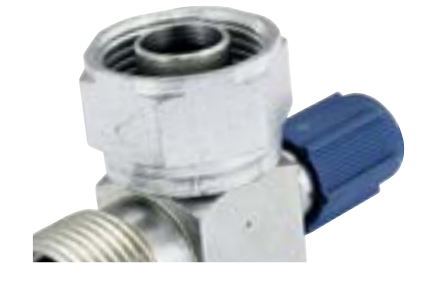
Not sure which fitting you need?